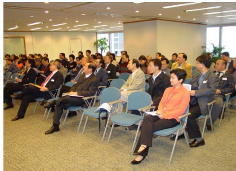
Participants in the joint workshop