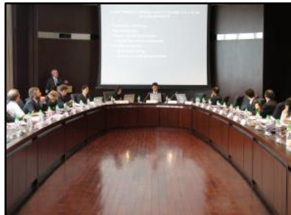
The conference was held on the Institute's premises.